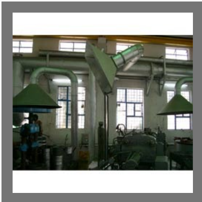
Fumes Extraction System