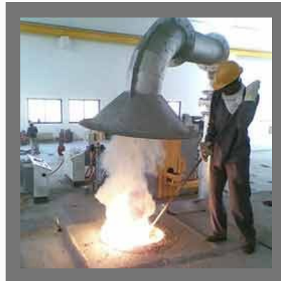
Fumes Extraction System