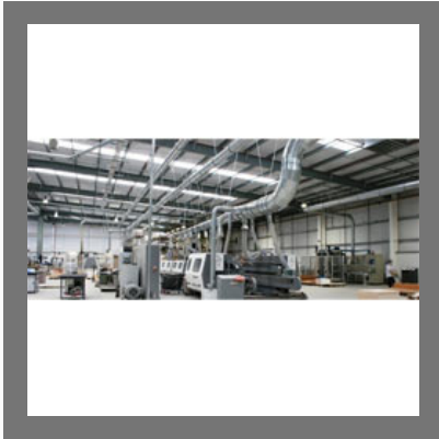
Dust Extraction System