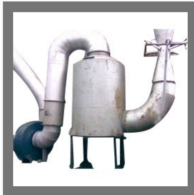
Venturi Scrubber Service