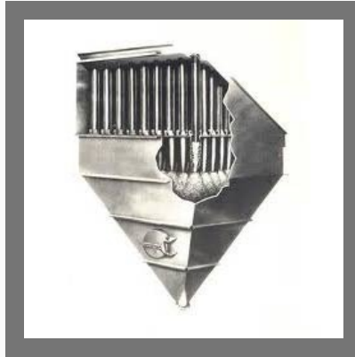
Industrial Multi Cyclone Dust Collector