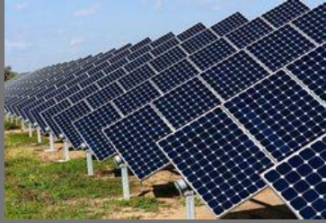
Solar Power Plant