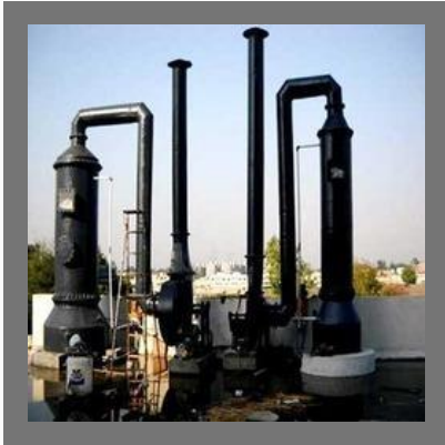
Air Pollution Control System