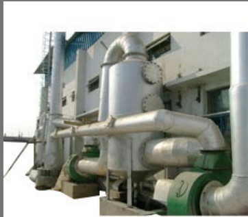
Industrial Dust Scrubber