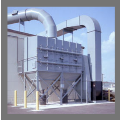
Centralized Air Pollution Control System Service