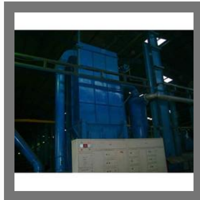
Pulse Jet Bag Filter