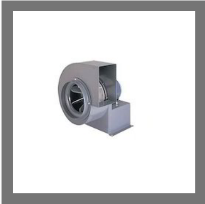
Heavy Duty Industrial Blower