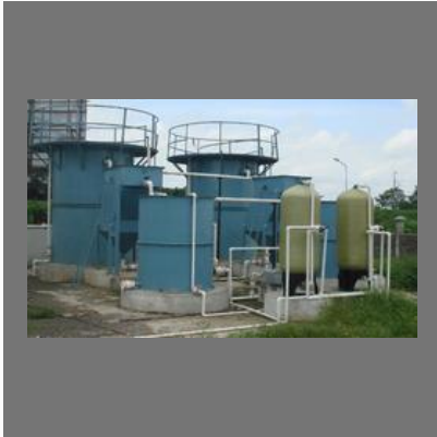
Industrial Effluent Treatment Plants