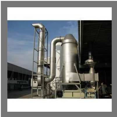
Ventury And Cyclonic System Service