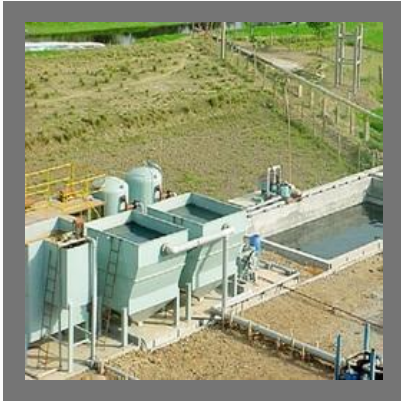
Sewage Treatment Plants