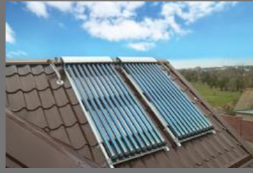
Solar Hot Water Generator