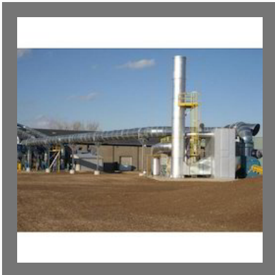
Rotary Concentrator System Service