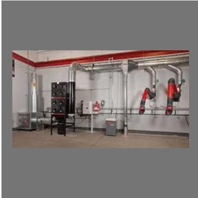
Industrial Fumes Extraction Systems