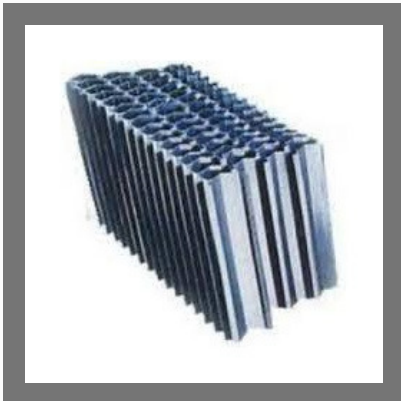
Tube Deck Media