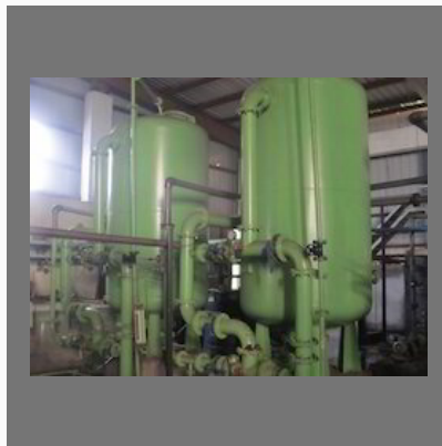
Multi Grade Filter