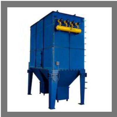
Industrial Bag Filter