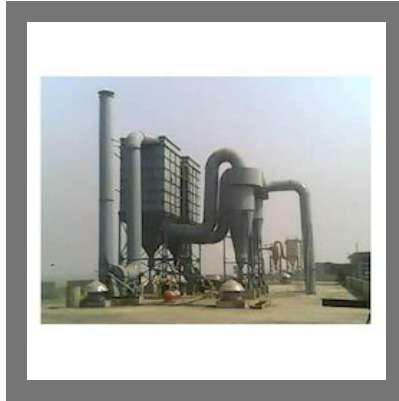
Dust Collector Service