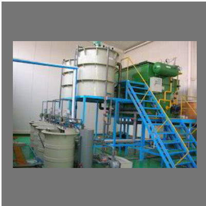
Waste Water Treatment Plants