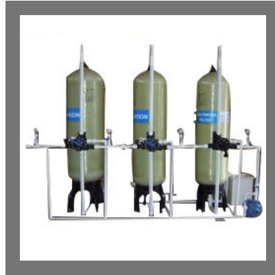
Industrial Demineralisation Plant