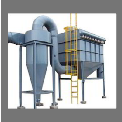
Offline Bag Filter