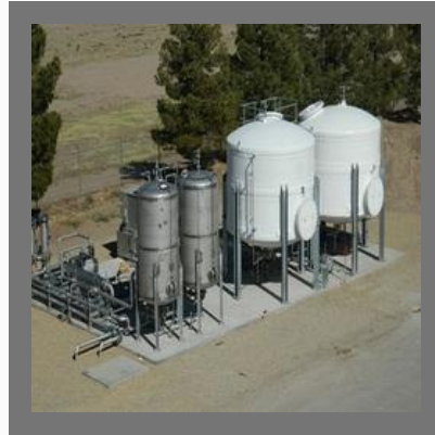
Compact Sewage Treatment Plants