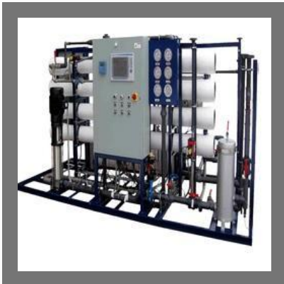
Industrial RO Plants