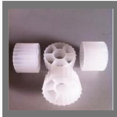
FAB Media Service