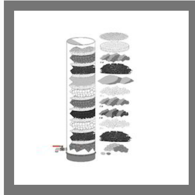
Activated Carbon Filter