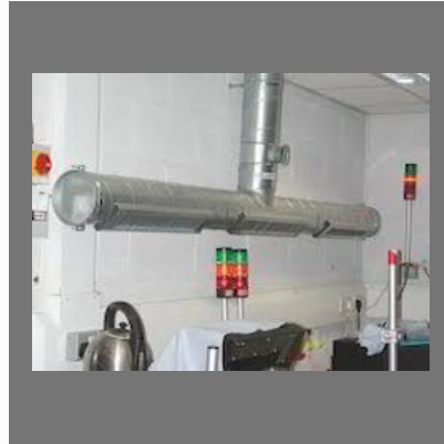
Fumes Extraction Systems