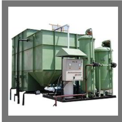
Waste Water Treatment Plants