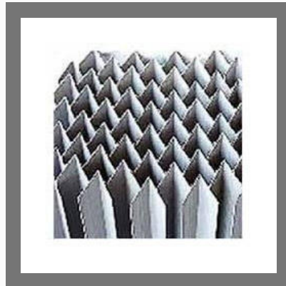
Tube Settler Media