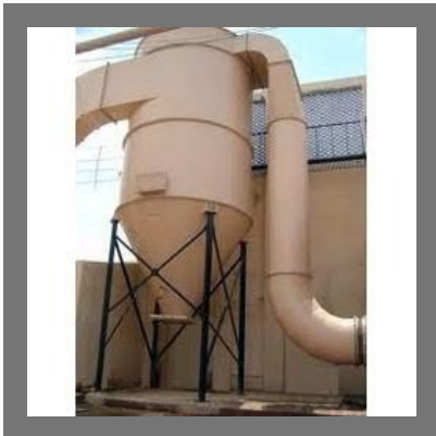
Industrial Cyclone Separator